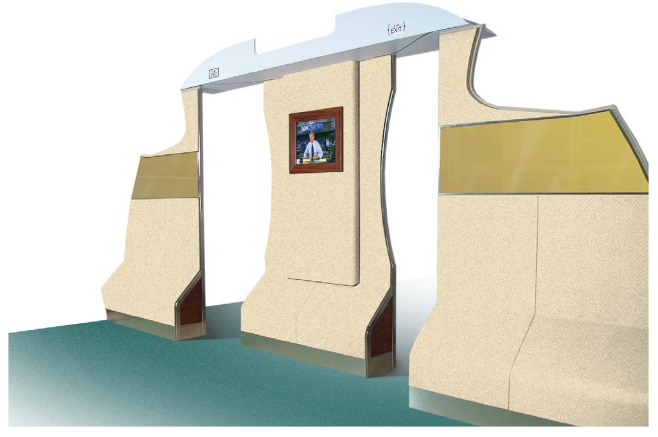
Lateral stowage • "doghouse"

Class divider • Executive conference area to business class area