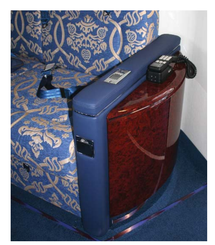
Armrest with movable fold out table • Surrounding for telephone set