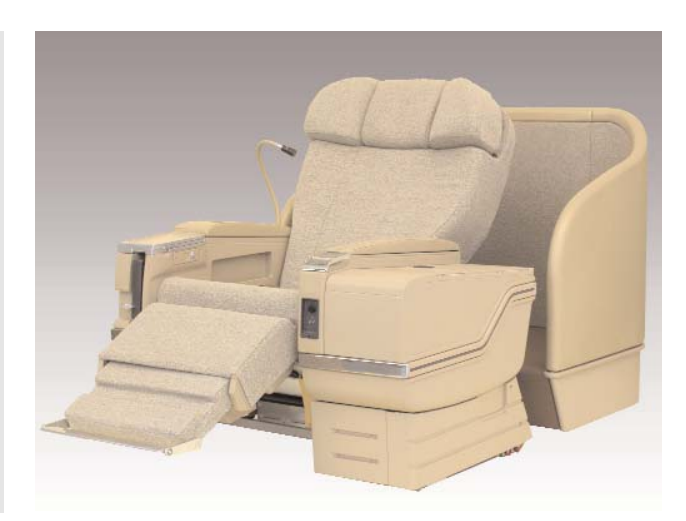
Single privacy compartment • Realisation