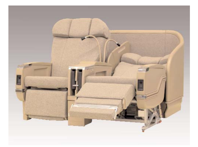
Double privacy compartment • Realisation