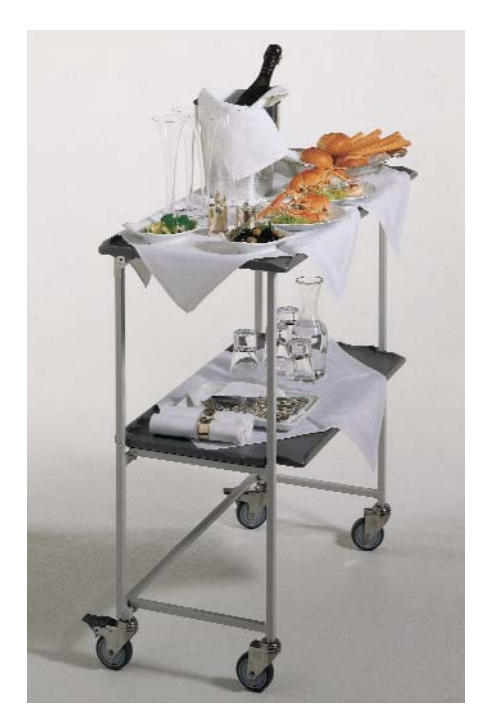
PNR 4893-series • Service cart