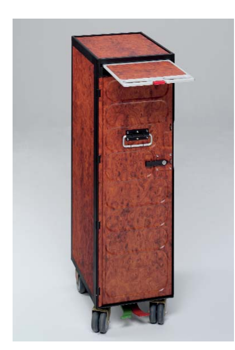
Half size trolley • Coated with DFC wood veneer

Due to our large product range in the airliner domain, we can adjust the ancillary equipment as regards the paint or veneer, and other decorative systems, to the environment of an executive cabin interior. We also furnish the cabin interior for the staff compartment based on the many standard products we manufacture.