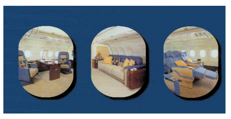
Cabin views • A319 CJ

Further aspects are technical documentation (ref. ATA 100 or customer's requirements) and the guarantee of spare parts support for the anticipated life of the product.