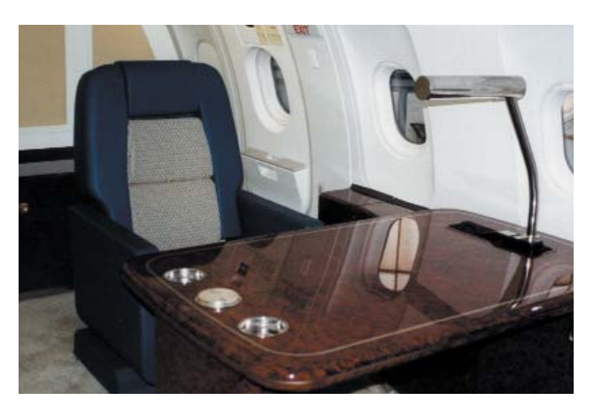
Desk top lamp • Ashtray • Glass holder