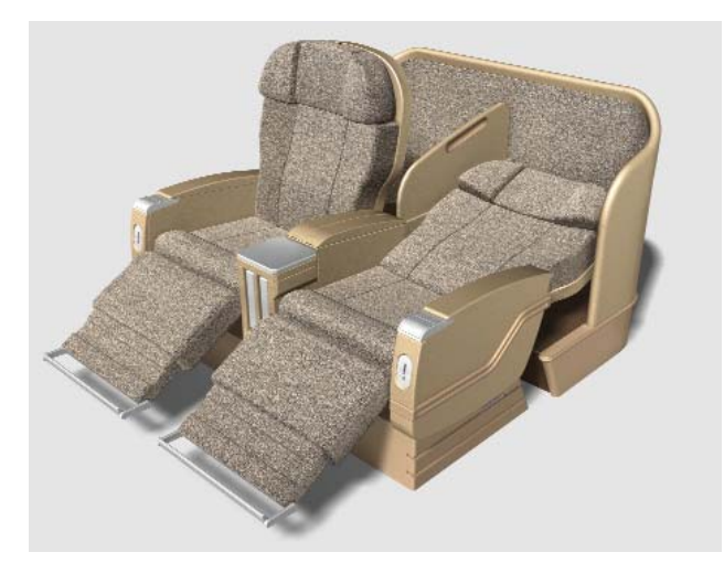
Double privacy compartment • Industrial design concept