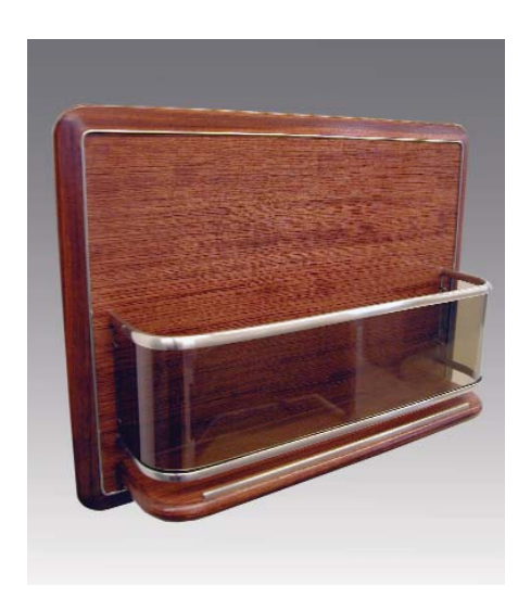
Magazine rack • real wood veneer