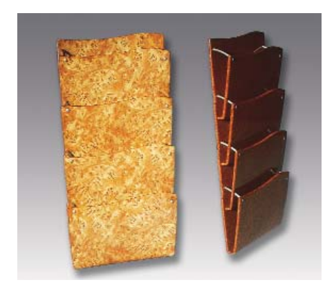
Magazine rack • real wood veneer