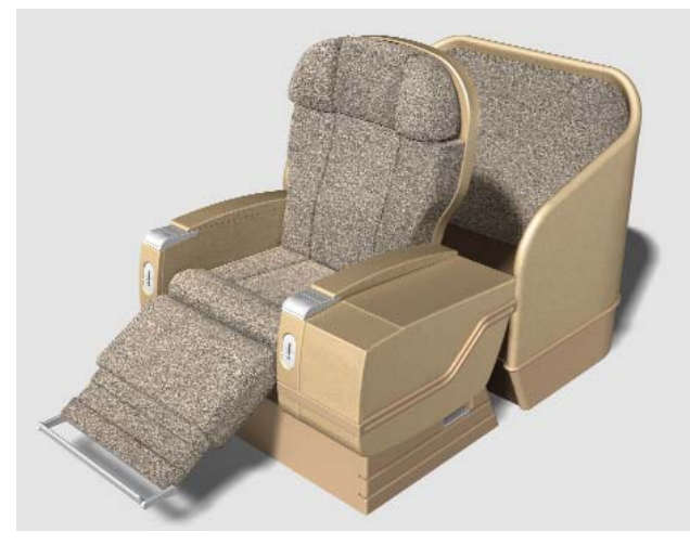
Single privacy compartment • Industrial design concept

Together with our industrial design partners Innovint can provide complete solution from industrial design concept, 3D visualisation to realisation including engineering, testing, certification, and manufacture.