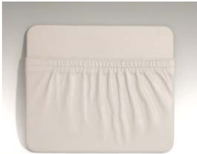
PNR 1140-61-series • Large literature pocket