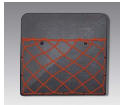
PNR 1140-20 • Cranked net pocket