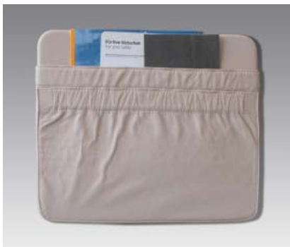
PNR 1140-68-series • Large double slot pocket

The literature pockets shown are Airbus standard equipment.