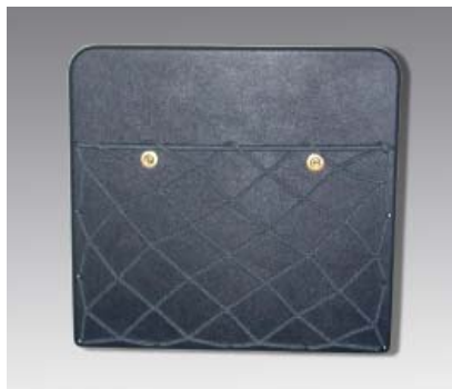
PNR 1140-19-series • Net pocket