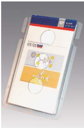
PNR 1240-11 • Check list holder