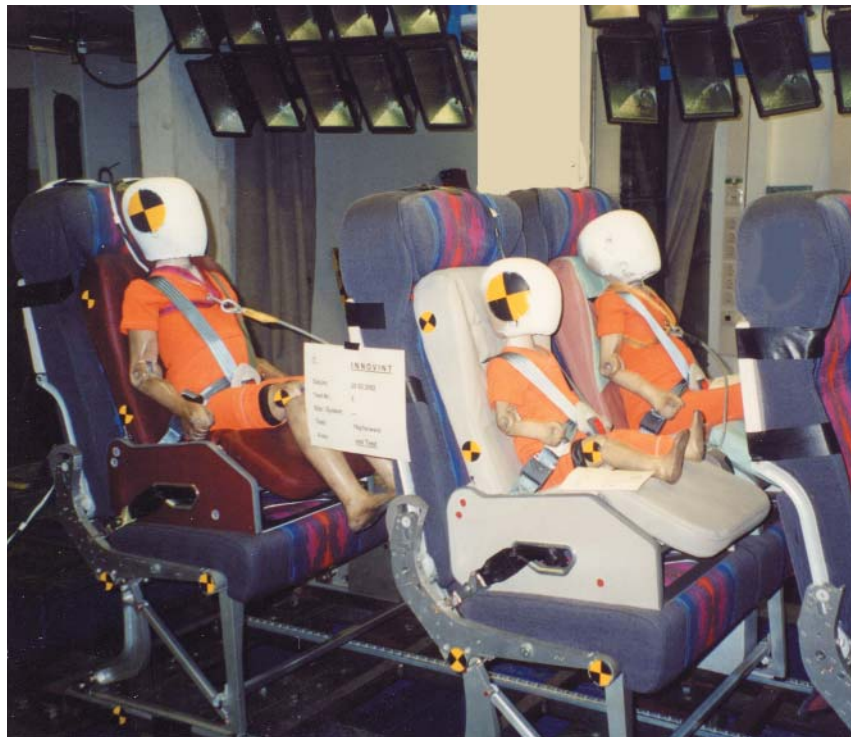
CRS – Child Restraint System • 16g dynamic test SAE AS 8049 with CRS FWD–Installation

The child restraint system has been tested using a combination of max. inflight loads and the emergency landing conditions according to EASA/FAR 25.561