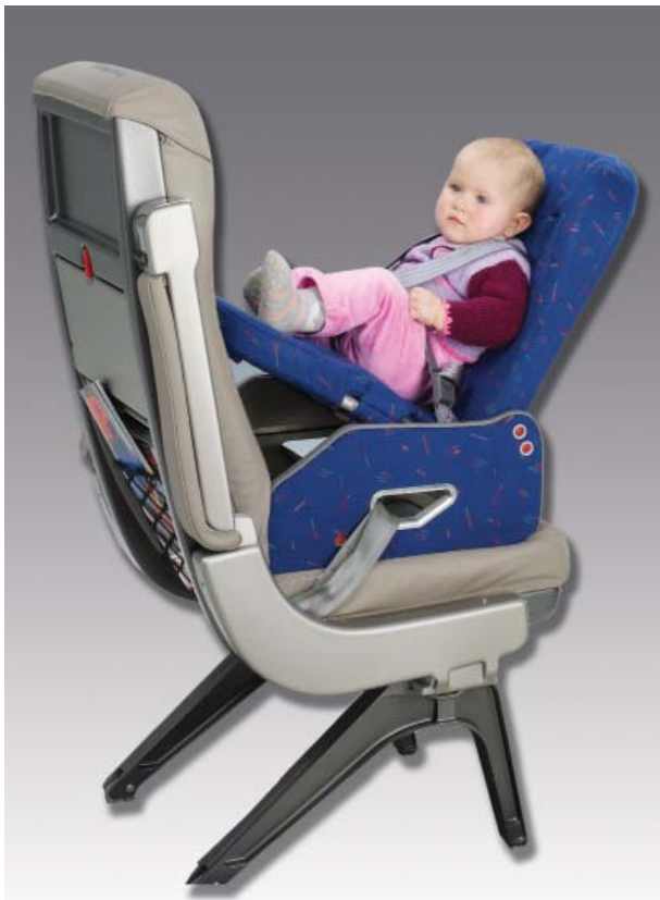
Child Restraint System • In aftward facing position for infants up to approximately one year

The safe transport of children in passenger aircraft is a high priority for parents, airlines and airworthiness authorities.