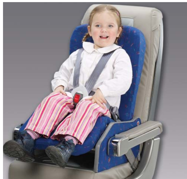
Child Restraint System • In forward facing position for toddler up to 6 years