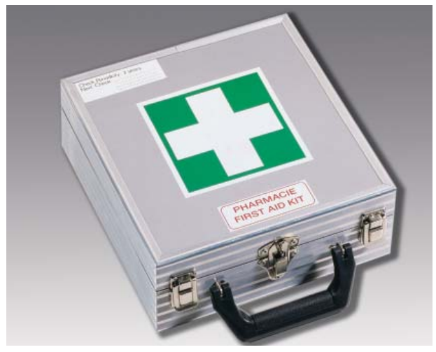
PNR 6240-series • First Aid Kit basic

The bracket PNR 6240-01-001 allows installation of the kit at any location. The bracket has been tested in our approved testing facilities for use in all directions (9g).