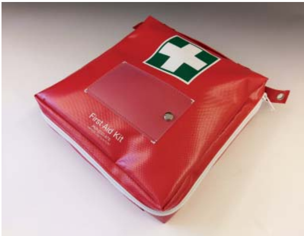
PNR 6240-87S • First Aid Kit, closed

The first aid kit PNR 6240-87S has been strictly assembled to the statutory requirements of EASA AIR-OPS. In addition the kit covers FAR 121, subpart X and ICAO, part I. The red soft bag is made from robust fire retardant material. The first aid kit is especially designed to be stored in AIRBUS A320 headrests of cabin attendant seats, hatrack lifeline spacers and several other unused cabin stowage spaces. It is light weight, easy to stow and has a transparent content paper card pocket visualizing relevant information like serial number and expiry date.