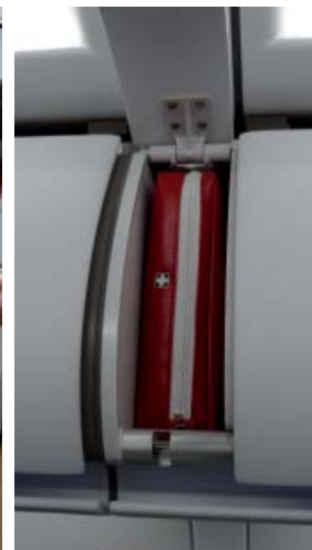
PNR 6240-87S • First Aid Kit stowed in A320 CAS headrest and hatrack lifeline spacer