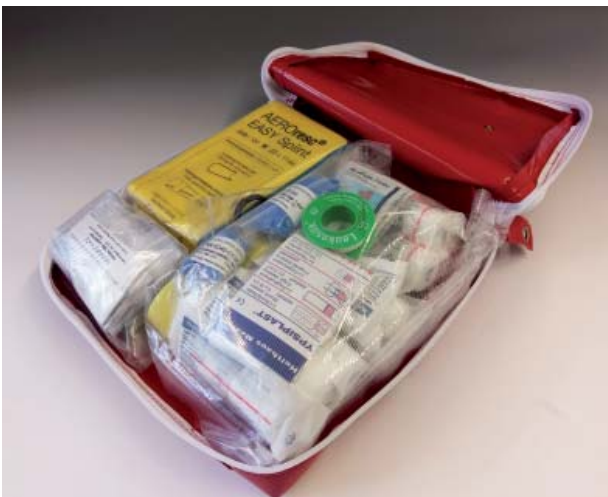
PNR 6240-87S • First Aid Kit, open