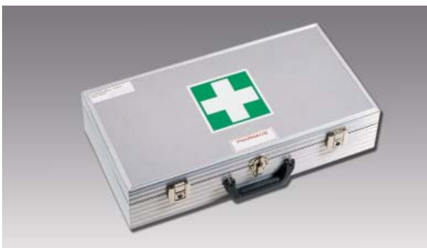
PNR 6240-22 • Emergency Medical Kit

The bracket PNR 6240-01-001 allows installation of the kit at any location. It has been tested in our approved testing facilities for use in all directions (9g).